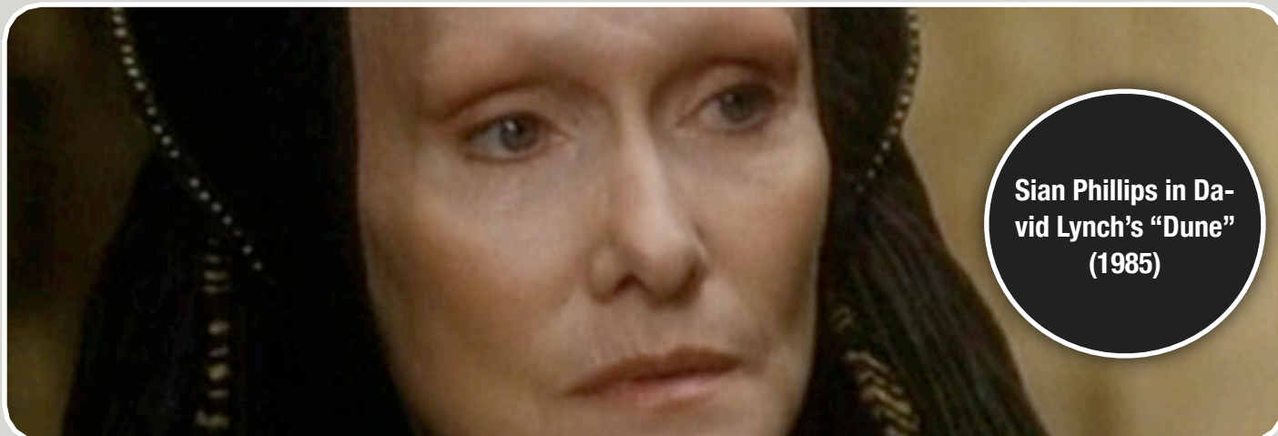
Sian Phillips in David Lynch's "Dune" (1985)